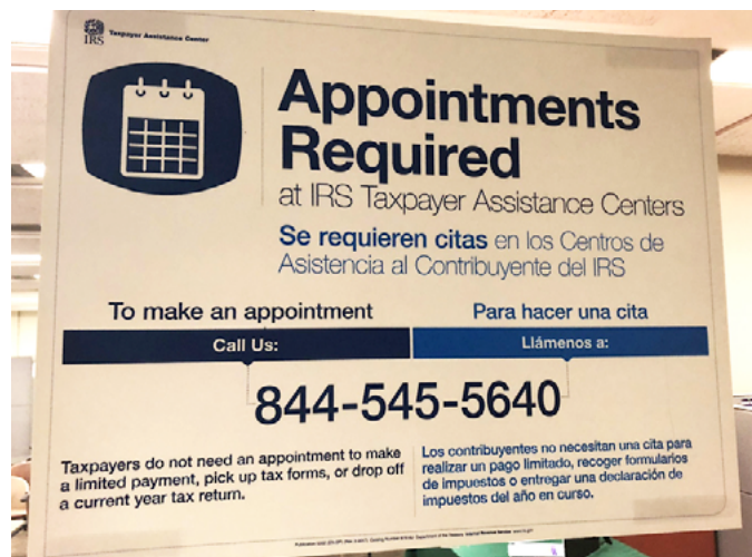
FIGURE 2.10.1, Sign at Taxpayer Assistance Center in Arkansas, Showing Appointment Requirement

Finally, the National Taxpayer Advocate is confused by the IRS assertion that it has updated the TAC signs to indicate appointments are not needed for certain routine tasks. When TAS staff photographed the "Appointments Required" signs at four TACs last year, the signs already contained the language about no appointments necessary to make a limited payment, drop off a current year tax return, or pick up a tax form. New photographs taken at the end of May 2018 of the same locations, such as the one from Arkansas below, show the same signs in place: